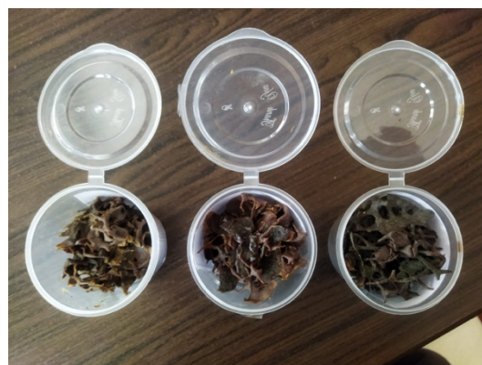
Figure 1. Propolis samples of the stingless bee ( H. itama )

Propolis samples (Figure 1) were collected from managed colonies of stingless bees identified as Heterotrigona itama . The bees were identified at the Forest Cultivation Laboratory, Faculty of Forestry and Tropical Environment, Mulawarman University, Indonesia. Species identification used morphological traits and standard meliponine bee taxonomic keys. Propolis was scraped from hive walls with sterile stainless-steel tools to avoid contamination. Samples were placed in sterile containers, transported to the laboratory, and stored at 4°C until extraction and analysis.