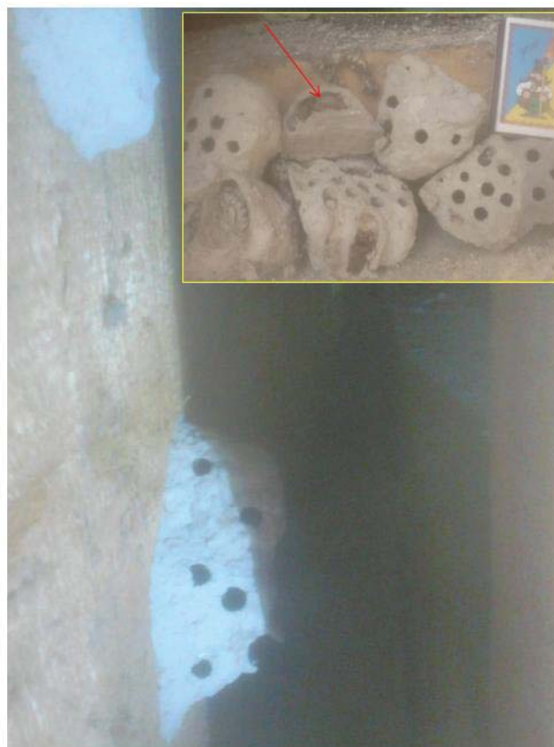
Fig. 1. The hornets nest. Red arrow at the inset points the residual of the larva dead in its cocoon. The box of matches (4 cm × 5 cm, right up corner on the inset) was added for sake of the nest components size estimation.

disturbed by the light. Additionally, the trays with NaOH aqueous solution were placed on the windowsill situated more than 2 m from the ground and were removed early in the morning, daily. We suppose that similar approach may be suggested for keeping the number of akin social winged bee killers, including Vespa velutina and Vespa soror (Mattila et al. 2020). For this aim, the improved trap device is recommended for installation and testing (Scheme 1).